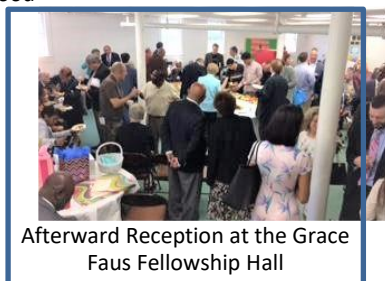
Afterward Reception at the Grace Faus Fellowship Hall